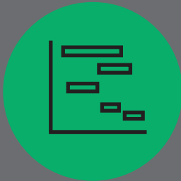
PROJECT MANAGEMENT DEPARTMENT